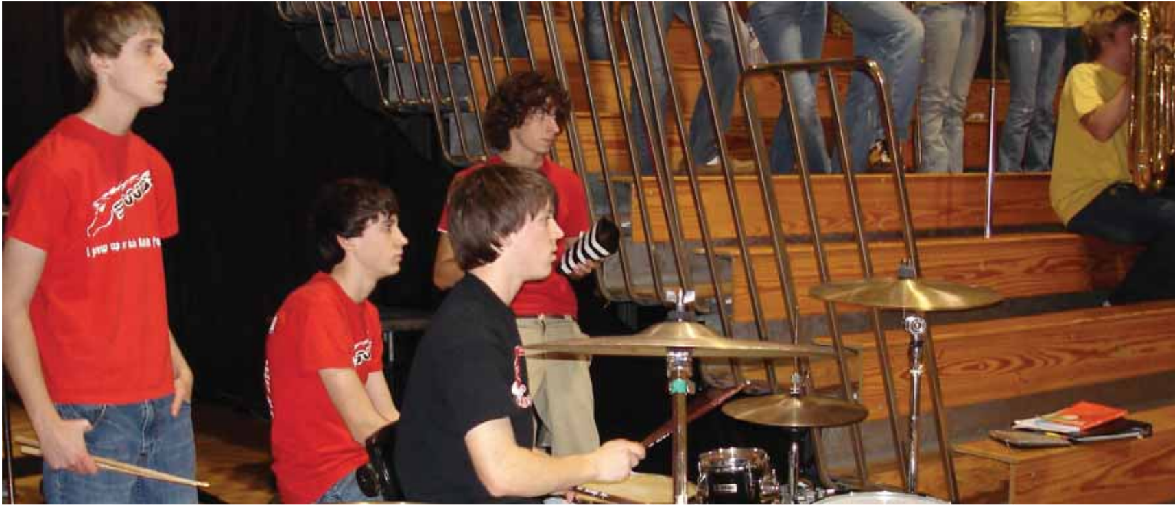
The High School Pep Band plays at our home basketball games.