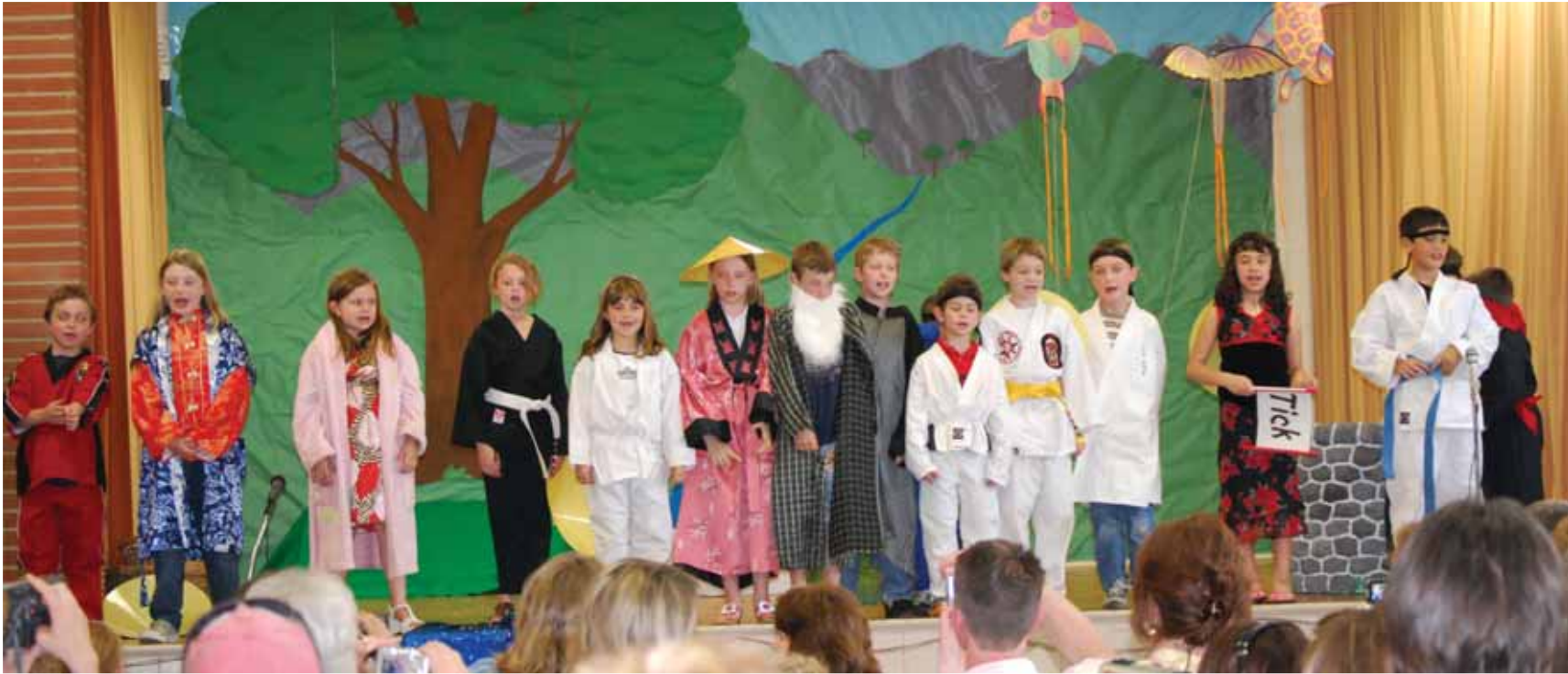
First and second grade students at Manheim Elementary perform in a musical play each spring.