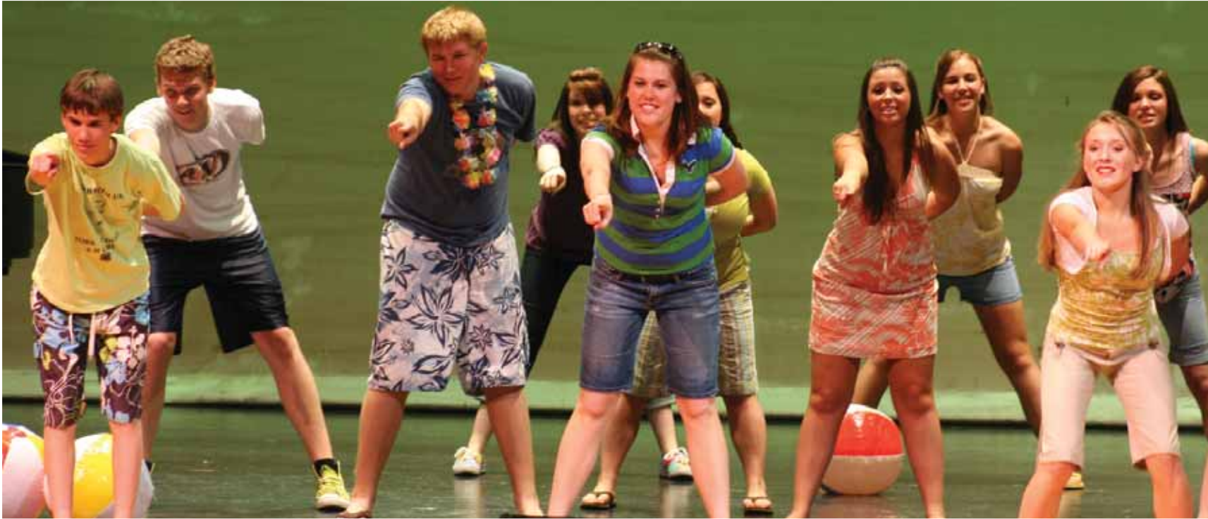
Our high school show choir, Singchronicity, performs at many events throughout the school year.