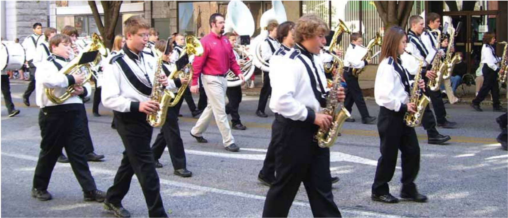
Our middle school band performs each year in the Memorial Day parade.