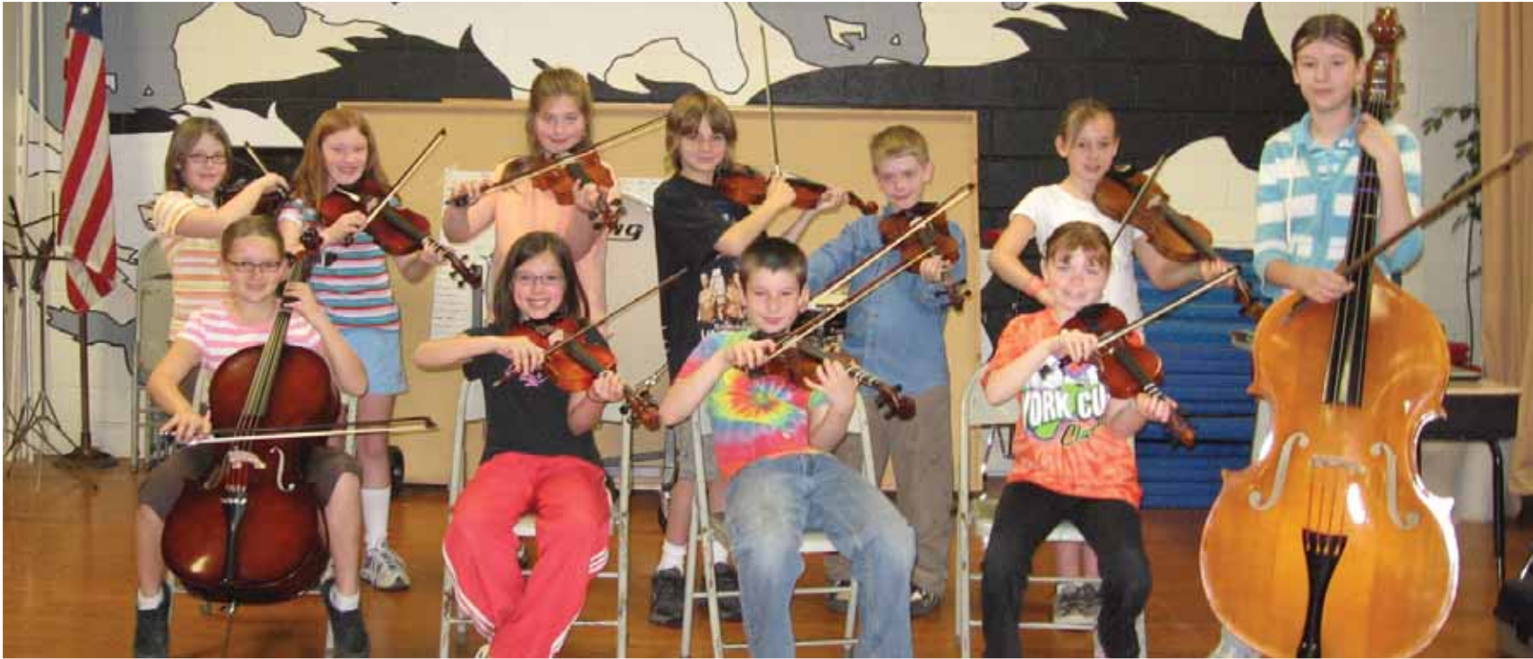
South Western's elementary strings and band programs begin for students in the fourth grade.