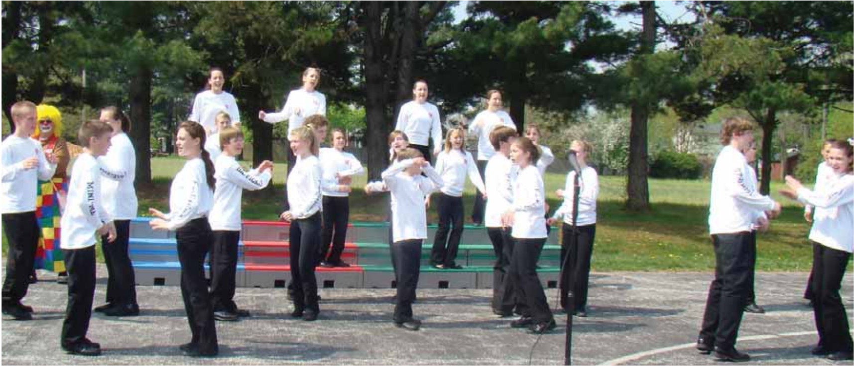
The Show Choir from Emory H. Markle Intermediate School performed on the grounds of the State Capitol.