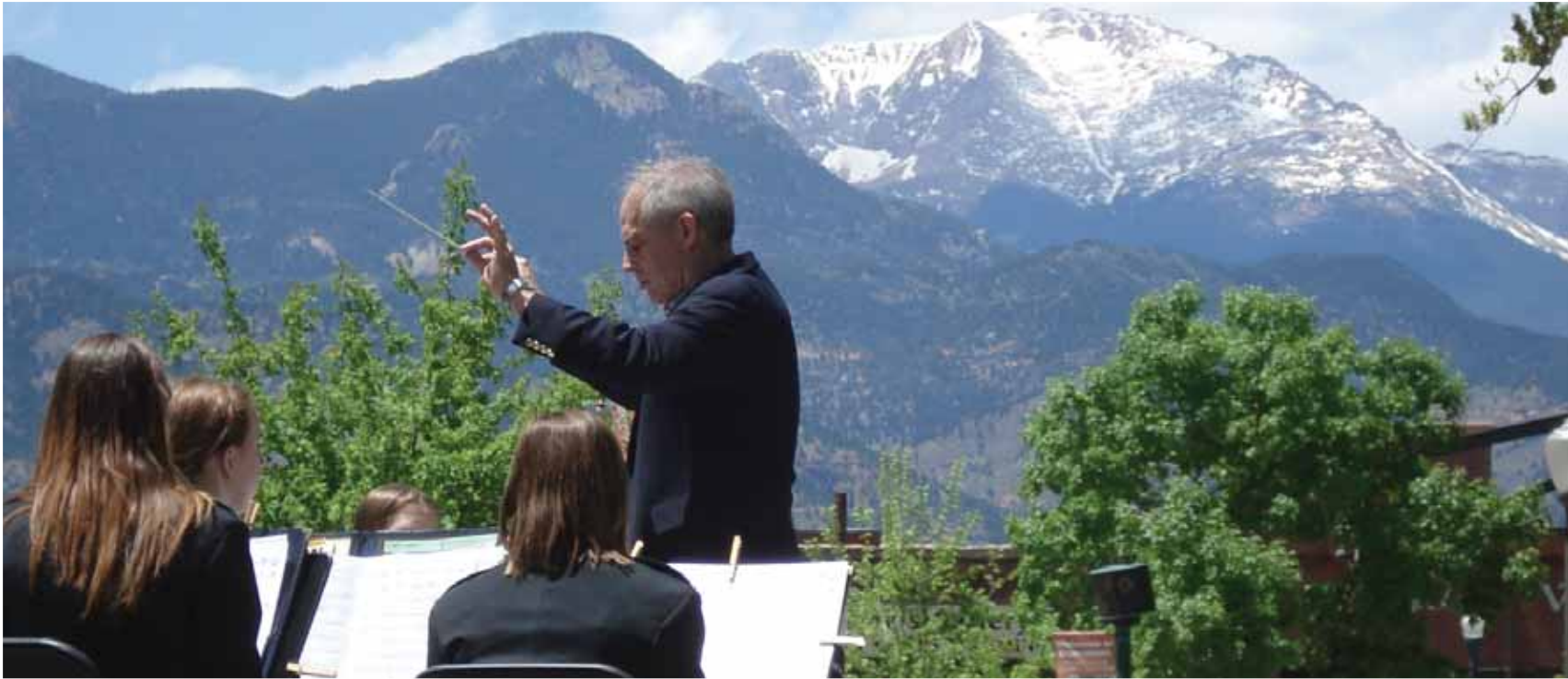
In 2008, our high school band and orchestra performed in Colorado.