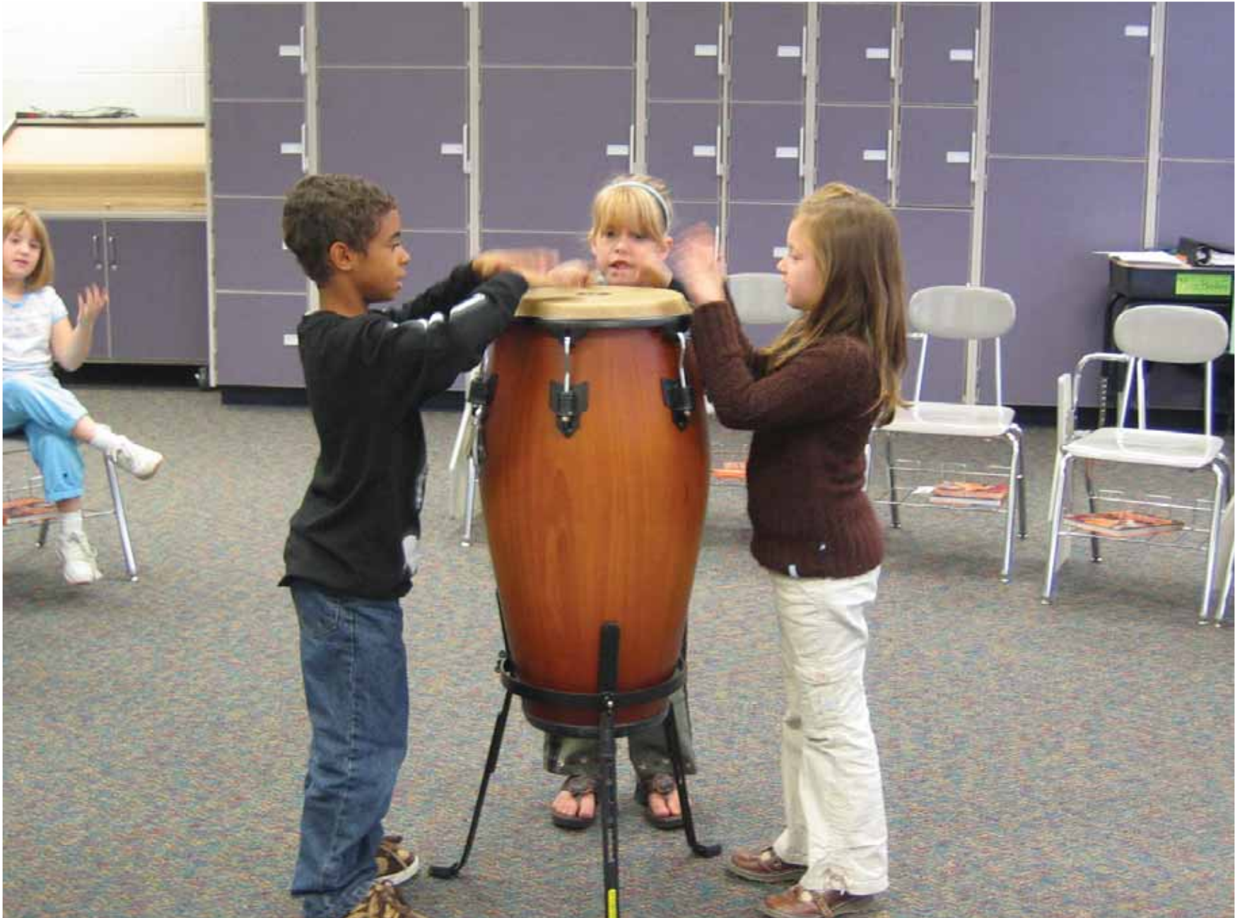
First grade students enjoy learning about different kinds of drums and the sounds they make.